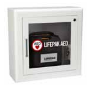
Surface Mount (7" Return)

AED Wall Cabinet with Alarm 11220-000079 (White) 11220-000076 (Stainless)