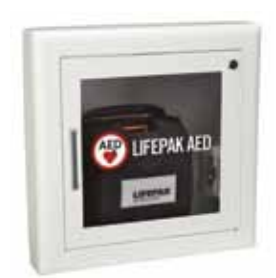
Semi-Recessed (3" Return)

AED Wall Cabinet with Alarm and Strobe 11220-000083 (White) 11220-000084 (Stainless)