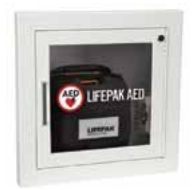
Recessed Mount (1.5" Return)

AED Wall Cabinet with Alarm, Fire Rated 11210-000026 (White)